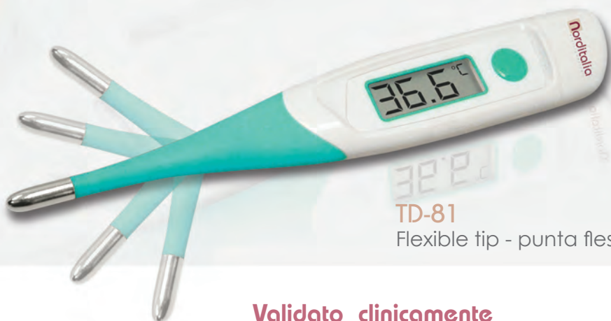
TD-81 Flexible tip - punta flessibile