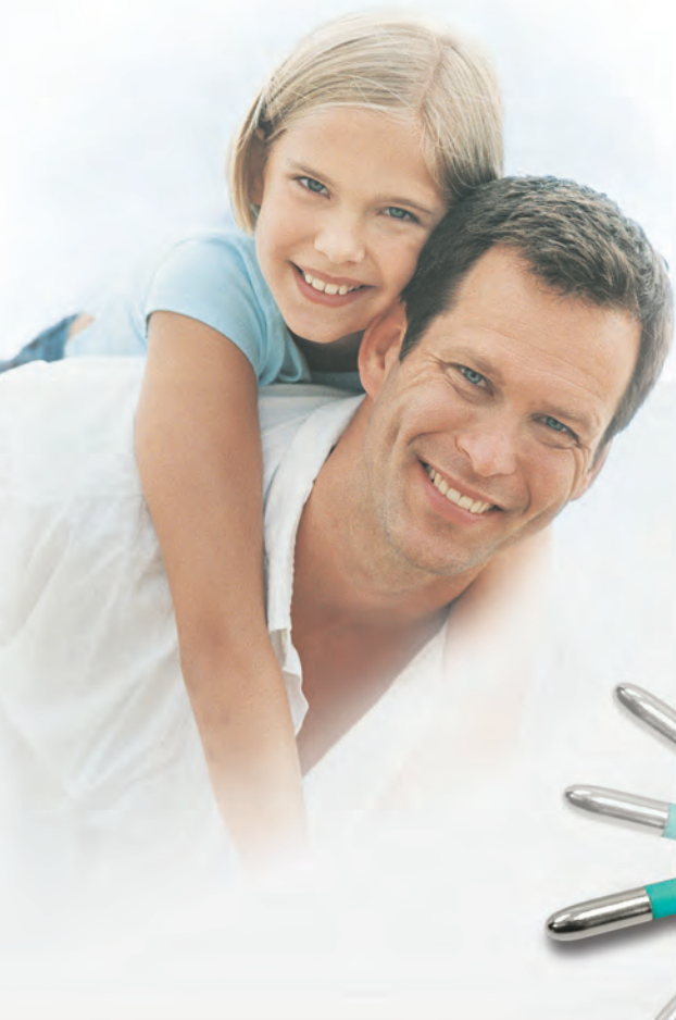
TD-20 Rigid tip - punta rigida